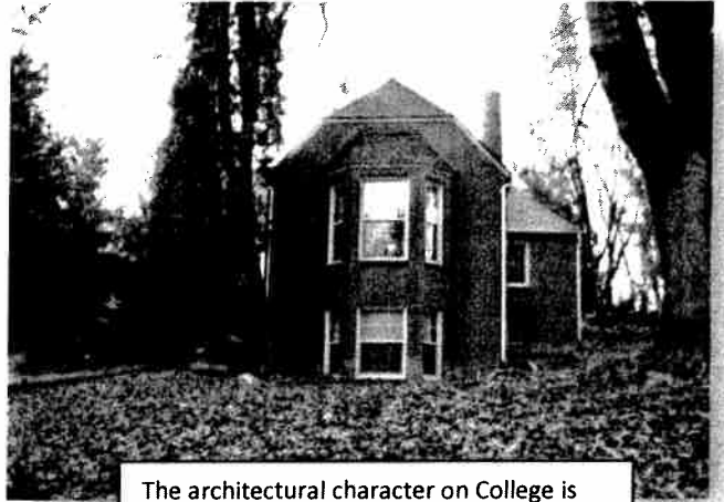
The architectural character on College is part of the history of Pullman and WSU.