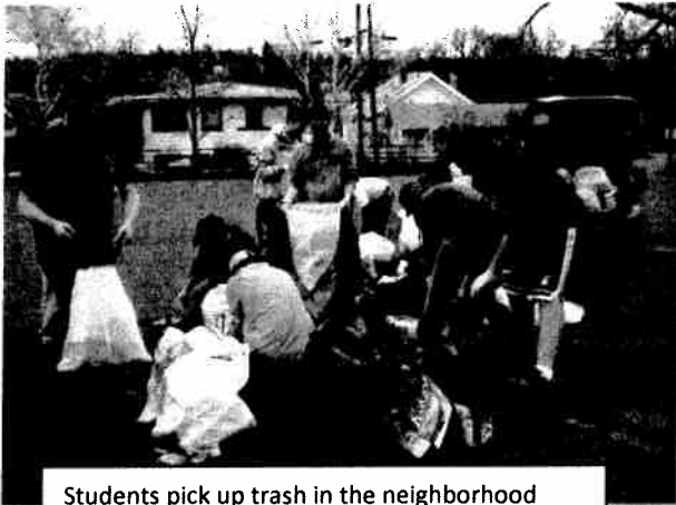
Students pick up trash in the neighborhood and sort recyclables after a weekend of parties.

University District Design Guidelines would provide information and guidance to property owners regarding the physical appearance of existing and future development within University District. This will involve the development of a design guidelines document created through an open public process.