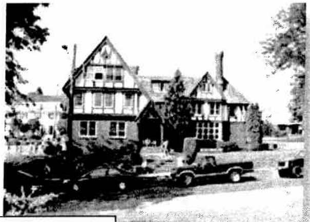
Apartments and Greek Houses provide the impression that the U District is part of WSU.