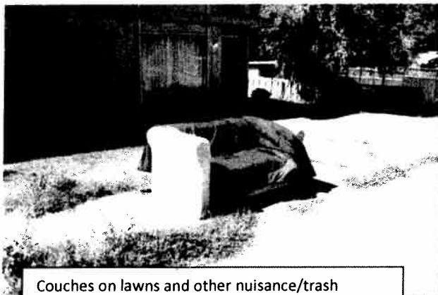
Couches on lawns and other nuisance/trash violations will be enforced.