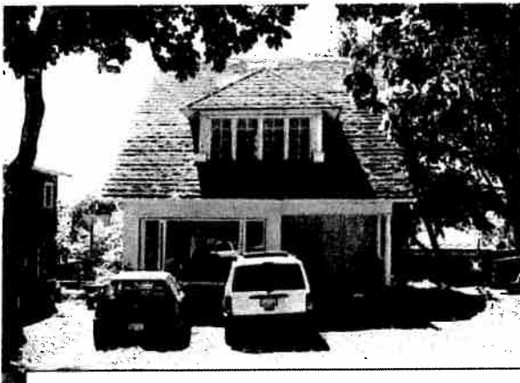
The City Parking Ordinance against parking on lawns will be strictly enforced.