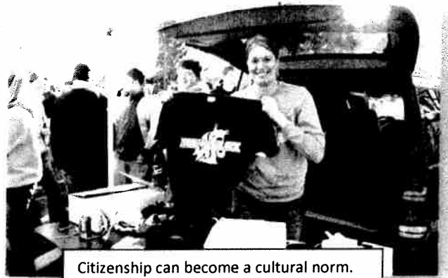
Citizenship can become a cultural norm.