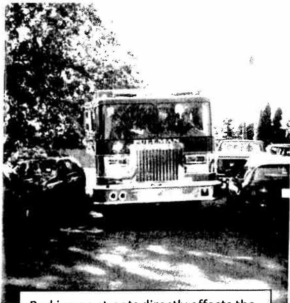
Parking on streets directly affects the safety of the neighborhood. Fire trucks must be able to pass safely.