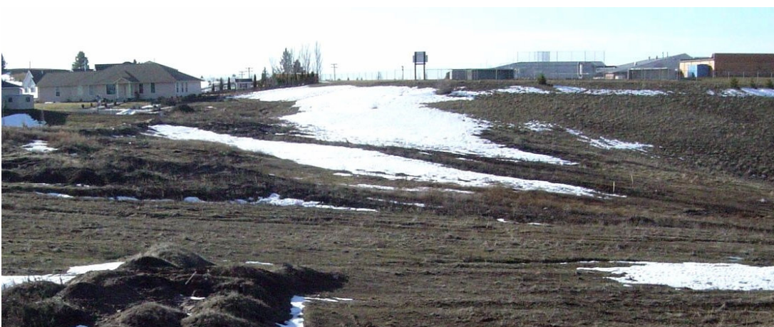
The site for the proposed church is currently vacant. High school facilities can be seen to the right in the background.

the following conditions: 1) all buildings and parking areas shall maintain a 15-foot setback from property lines; 2) a screen (consisting of a solid fence or wall plus sight-obscuring landscaping) shall be established around the perimeter of the property; and 3) the parking area shall be screened along the property line abutting Park View Drive with a landscaped hedge. Barring any appeals, the applicant is expected to act on this construction project within the next year.