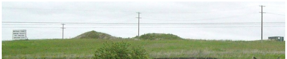
The animal shelter is proposed to be located on Old Moscow Road near its intersection with Johnson Avenue.